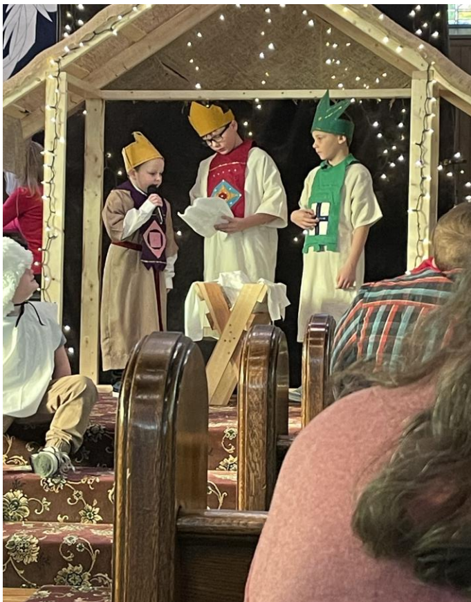
We Three Kings