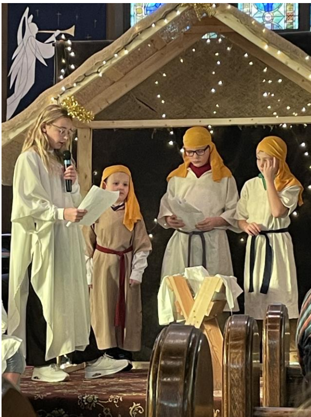
The angel and the shepherds