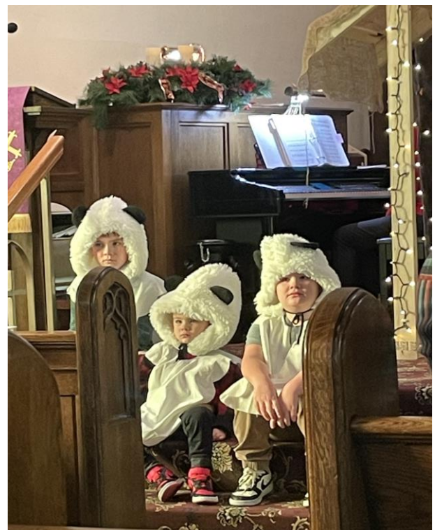
The Three sheep