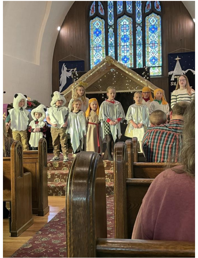
The Entire Cast & Crew